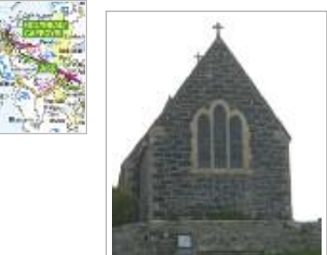
St Gwenfaen's Church, Rhoscolyn

Worship takes place in all our churches each Sunday and during the week, please visit www.holyheadparishchurches.co.uk for further details